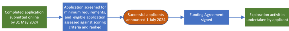
Figure 9 Application Flow Diagram